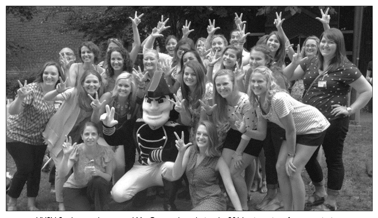
VUSN Students gather around Mr. Commodore during the 2014 orientation afternoon picnic.