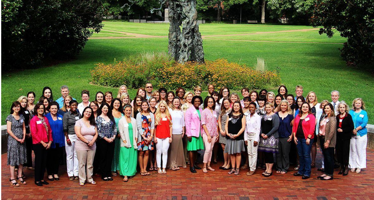
VUSN DNP Students gather for a group photo during the 2014 fall Intensive.