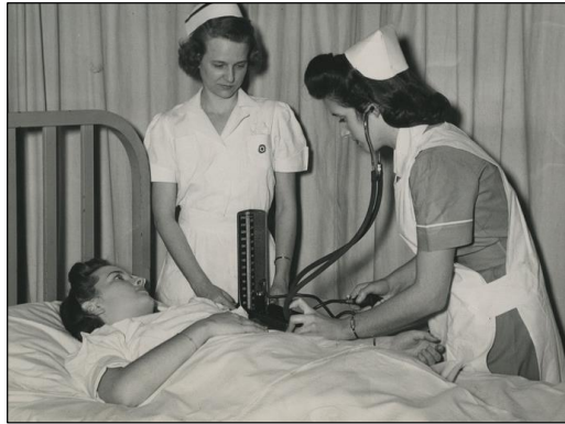
Students from the Vanderbilt School of Nursing class of 1946 practice taking blood pressure readings from patients.

The Vanderbilt University School of Nursing opened in 1909, offering a three-year diploma program in nursing. The first Bachelor of Science degree was awarded in 1936, and the first Master's degree in nursing in 1958. The School of Nursing is one of the nation's first nursing programs to incorporate nursing into a liberal arts degree. Having phased out its undergraduate degree program in 1989, the School now offers a curriculum that enables Pre-Specialty students from diverse backgrounds to move into the master's and doctoral levels of study and prepare for careers in advanced practice nursing. Currently, "U.S. News and World Report" ranks the Vanderbilt School of Nursing as #11 in the Top Schools of Nursing in the country.